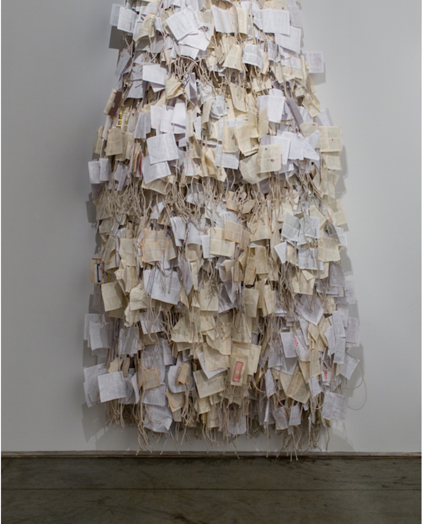
Hassan Sharif, Dictionary , 2015. Glue, dictionary pages and cotton rope. 380 x 190 x 80 cm approx.

It's interesting you say that, because they also often create big shelters for communities, under the interconnected canopies. Do you see this canopy of images in some way as holding back and containing communities and social structures?