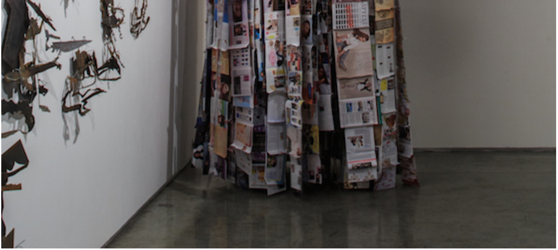
Hassan Sharif, A Pillar of Images , 2015. Magazine pages, staples and cotton rope. 1000 x 170 x 160 cm approx.

It's interesting to think about language in that way too: that access is restricted to the language you speak, even in the visual arts. How did you then, and how do you now, transcend these barriers?