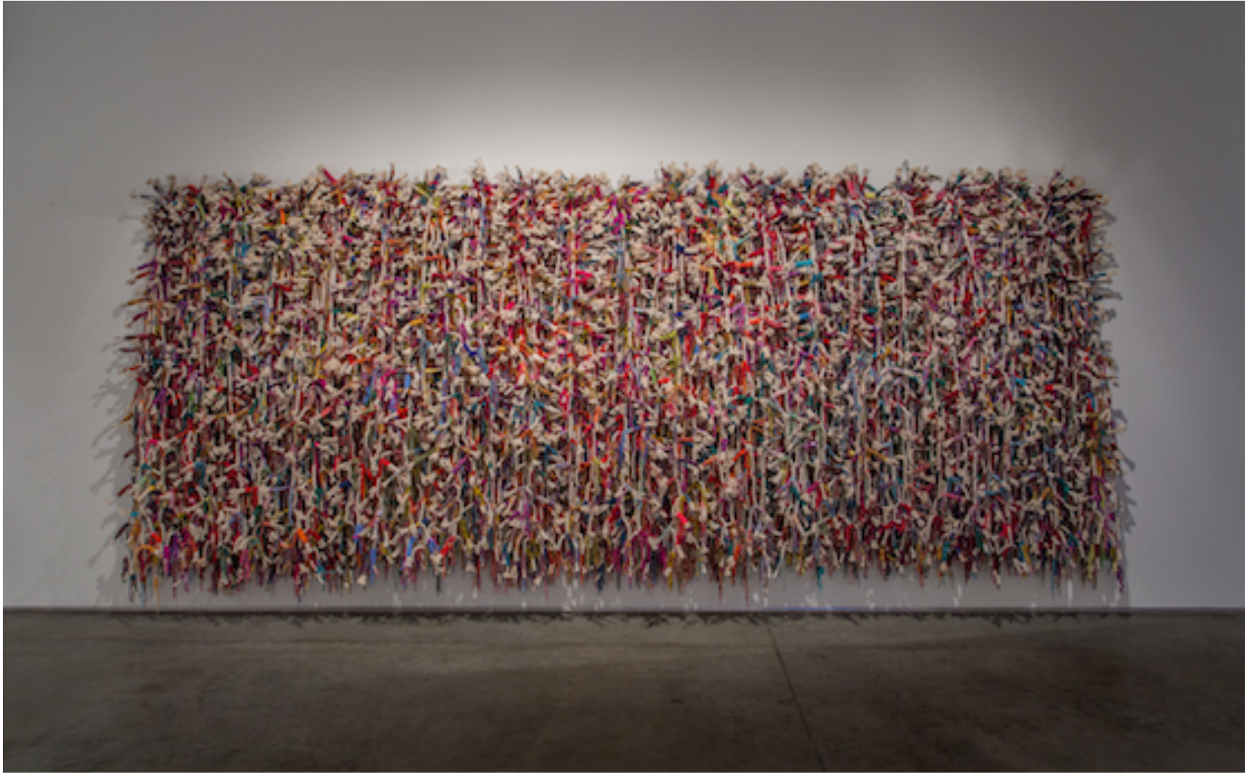
Hassan Sharif, Cutting and Tying , 2014. Installation view.

That's a beautiful statement for any artist to hold on to. Because inevitably, you cannot avoid history. It will come up on its own. You don't need to focus on it.