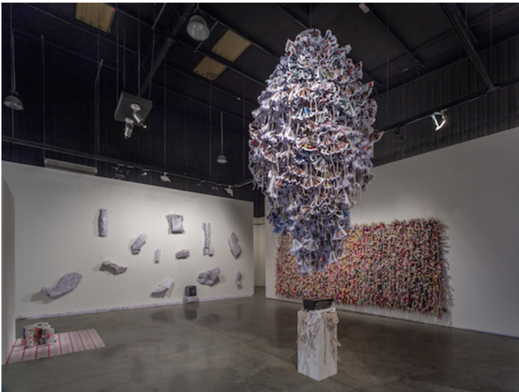
Hassan Sharif, Printer No. 1 , 2015. Installation view.

are yours? Do you recognise yourself in these?