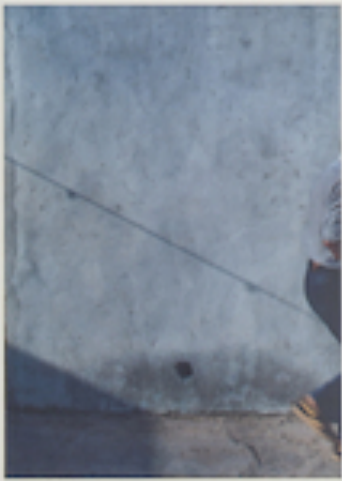
Jumping No. 1. 1983. WLR