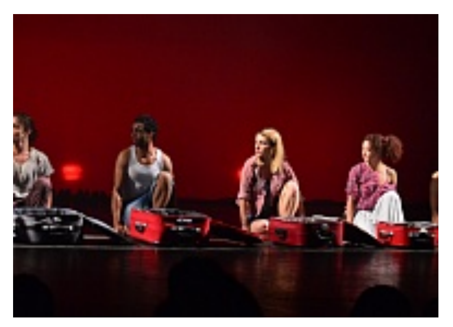
Show of Lebanon-based Syrian artists to open underneath London train station