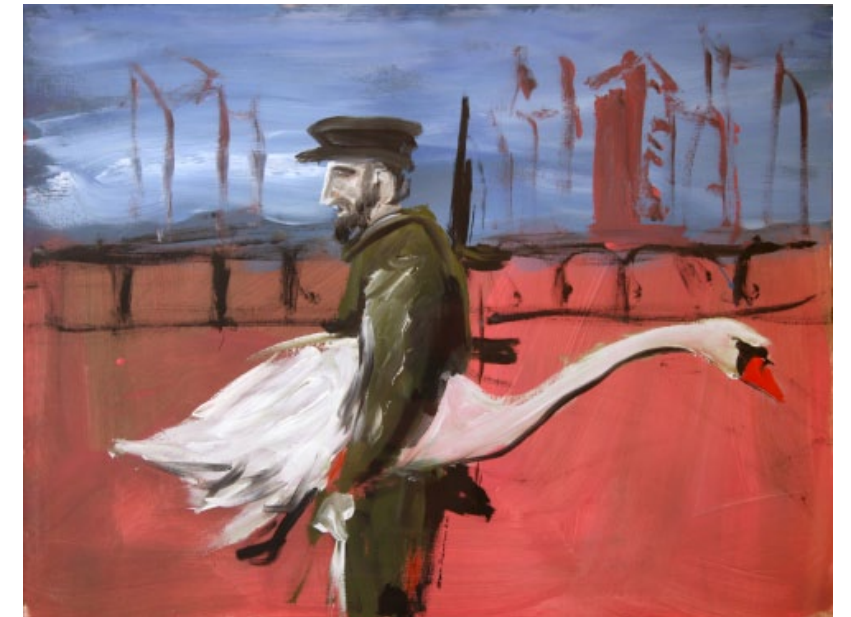
Captured Swan, 2011, acrylic on paper, 57 x 75 cm

Whatever the source of inspiration, it is always challenged through the process of creating an artwork. The process or decomposing period between life and death, and back round to life, is very important to me. I'm interested in how this process leads to creation, in a way that is similar to the process of creating art and painting.