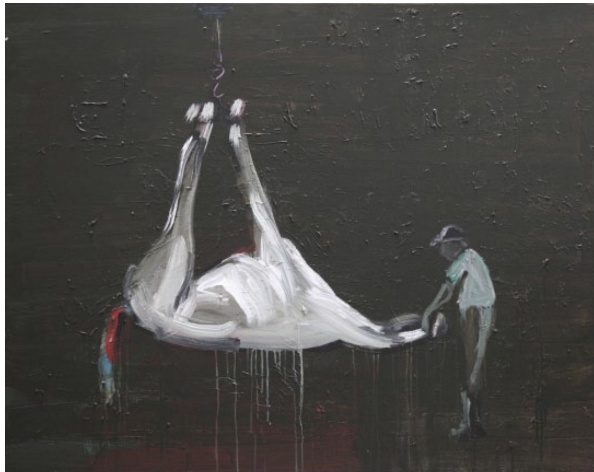
White Horse, 2011, acrylic on canvas, 120 x 150 cm