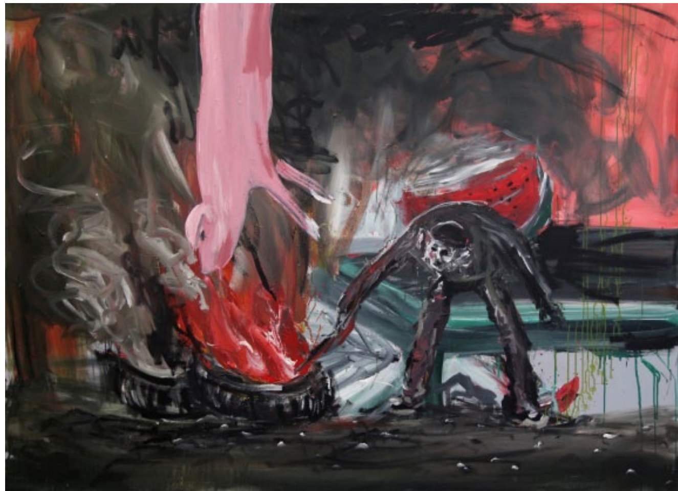
Barbecuing for Vegetarians, 2011, acrylic on canvas, 142 x 192 cm

Photoshop and digital media alike are just another medium. If they facilitate the artist's ambitions or enhance their developments, then why not use them, as David Hockney did. This being said, no medium can ever replace another – technical or technological progressions are not used exclusively over older methods.