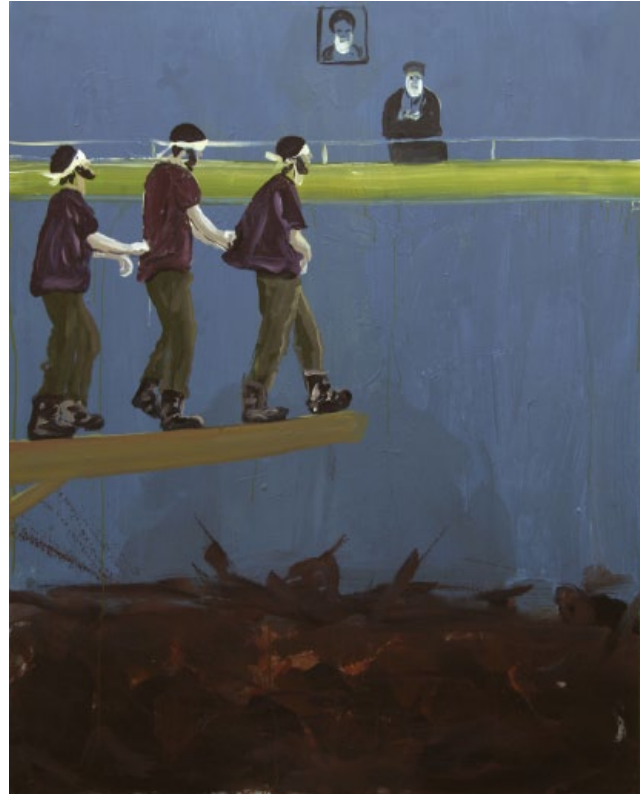
Follow the Leader (I), 2010, acrylic on canvas, 180 x 145 cm, courtesy of the artist and Gallery Isabelle van den Eynde