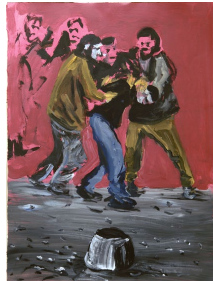
Detaining the Guardian, 2010, acrylic on paper, 77 x 57 cm, courtesy of the artist and Gallery Isabelle van den Eynde