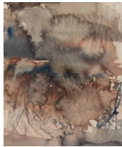
Scene 1 - No.3 , 1998 Watercolor on cardboard 14.7 x 12.5 cm Frame: 35 x 35 cm (MK/PA 598)