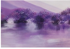
Landscape 1 , 1999 Acrylic on paper 35 x 50 cm Frame: 52 x 66.5 cm (MK/PA 590)