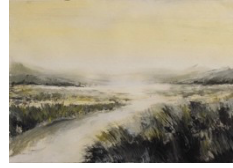
Landscape 2 , 1999 Acrylic on paper 35 x 50 cm Frame: 52 x 66.5 cm (MK/PA 591)