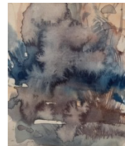
Scene 1 - No.1 , 1998 Watercolor on cardboard 14.7 x 12.5 cm Frame: 35 x 35 cm (MK/PA 596)