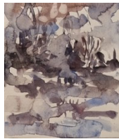
Scene 1 - No.4 , 1998 Watercolor on cardboard 14.7 x 12.5 cm Frame: 35 x 35 cm (MK/PA 599)