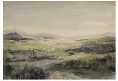
Landscape 3 , 1999 Acrylic on paper 35 x 50 cm Frame: 52 x 66.5 cm (MK/PA 592)