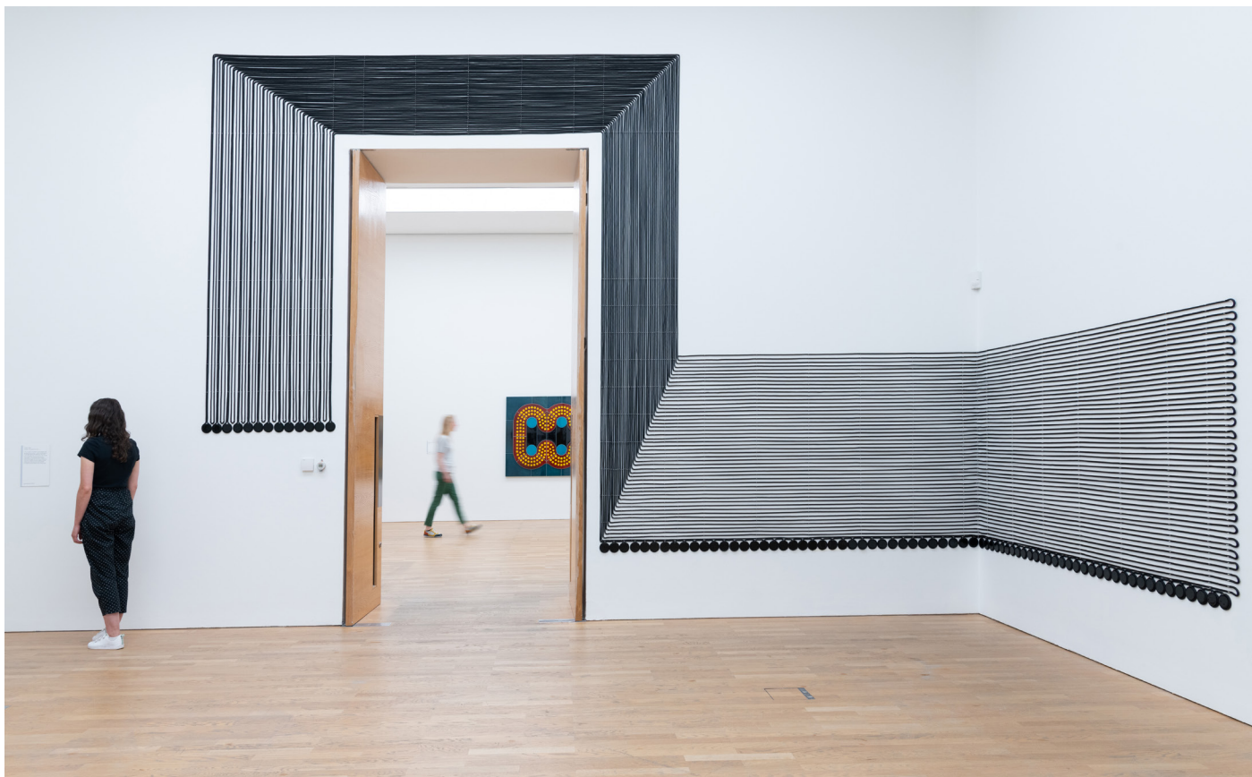
Clinch , 2022, Polyester rope, glazed ceramic, site specific installation at MIMA, Middlesbrough, UK

teems an intricacy of detail. Now-iconic works like Metropolis (2019) and the Islamic Biennial-commissioned Endless Iftar (2023) capture both the vast and the minute in one generous gesture. The built environment looms: in Disjunctions , Bind (2023) enlists industrial materials into an exploration of their potential for art-making that not only references the systems and infrastructures of our built environment, but also the industrial conformity of our time.